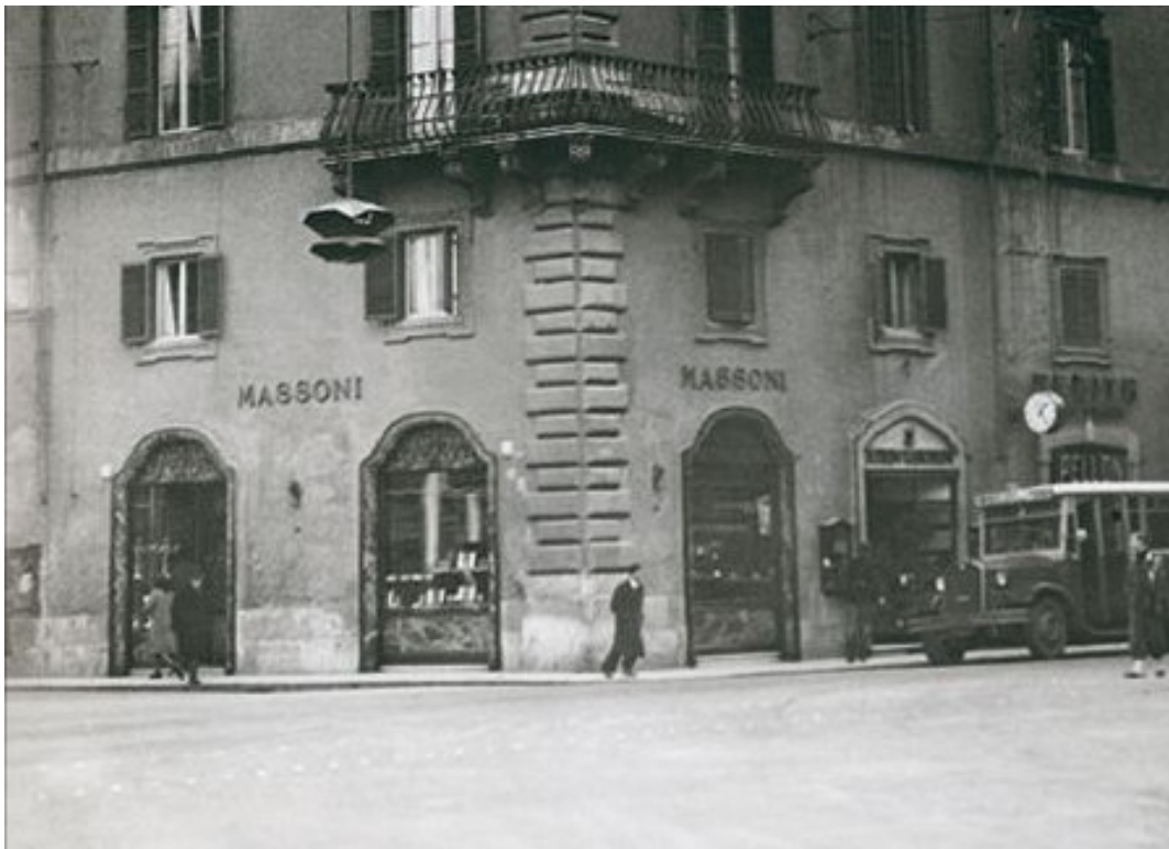
The Massoni store in the mythical Via Condotti, on the corner with Largo Goldoni, Roma, Italy